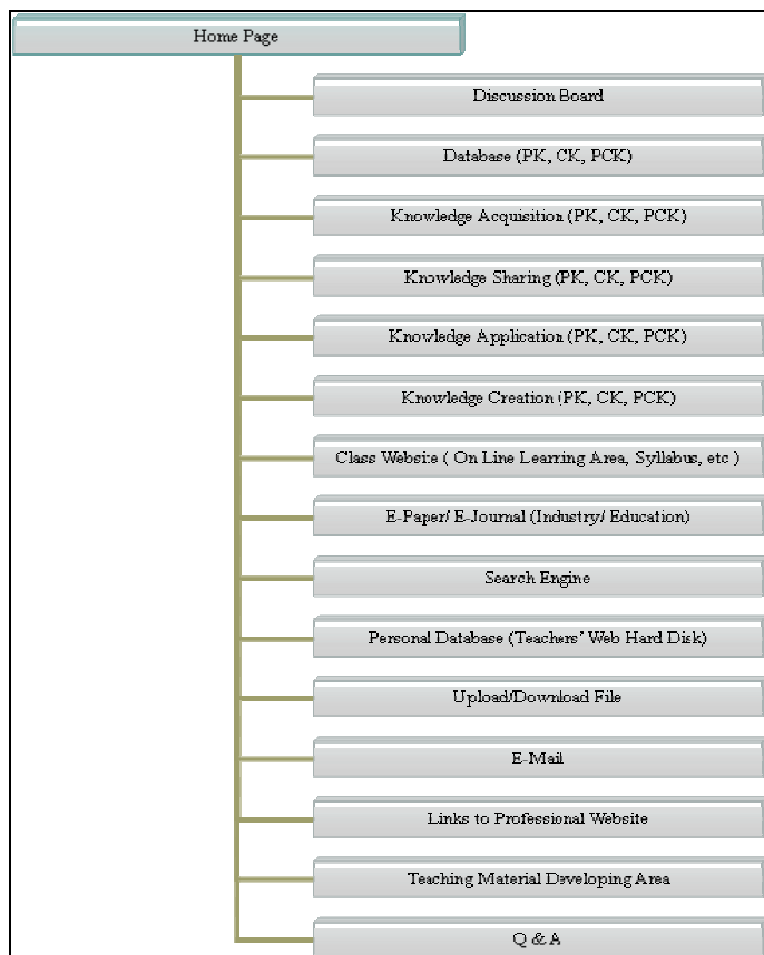
Figure 1: The system mode of Knowledge Management Platform for mechanical teachers in vocational high schools.